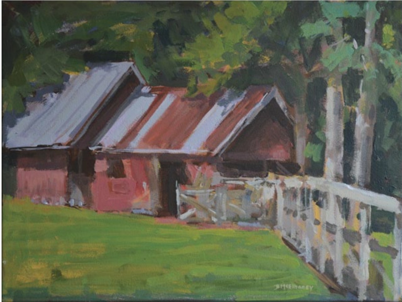
Goat Barn at Highland Lake Acrylic on Canvas 12 x 16 inches

BRENNEN McELHANEY Fine Art | Landscapes | Portraits