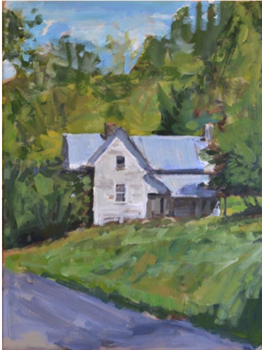
Circa 1910 Acrylic on Canvas 16 x 12 inches

BRENNEN McELHANEY Fine Art | Landscapes | Portraits