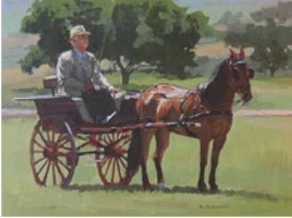
Brennen McElhaney, Carriage Classic Acrylic on paper, 8.75 x 12.25 in.