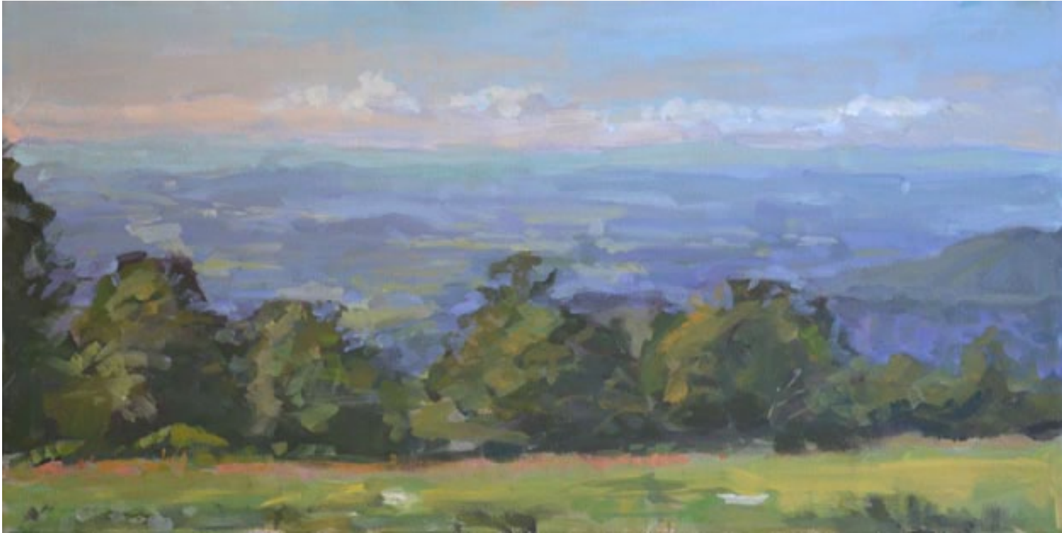
Bearwallow Vista Acrylic on Canvas 12 x 24 inches

BRENNEN McELHANEY Fine Art | Landscapes | Portraits