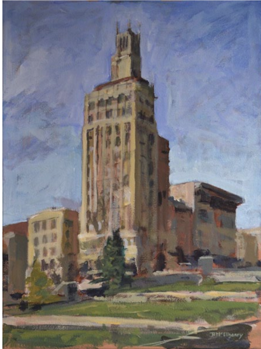
Jackson Building Acrylic on Canvas 16 x 12 inches

BRENNEN McELHANEY Fine Art | Landscapes | Portraits