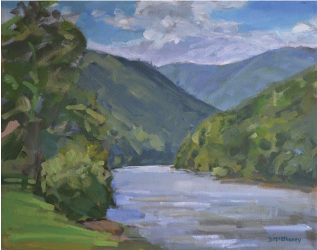
Nolichucky River Gorge Acrylic on Canvas 11 x 14 inches

BRENNEN McELHANEY Fine Art | Landscapes | Portraits