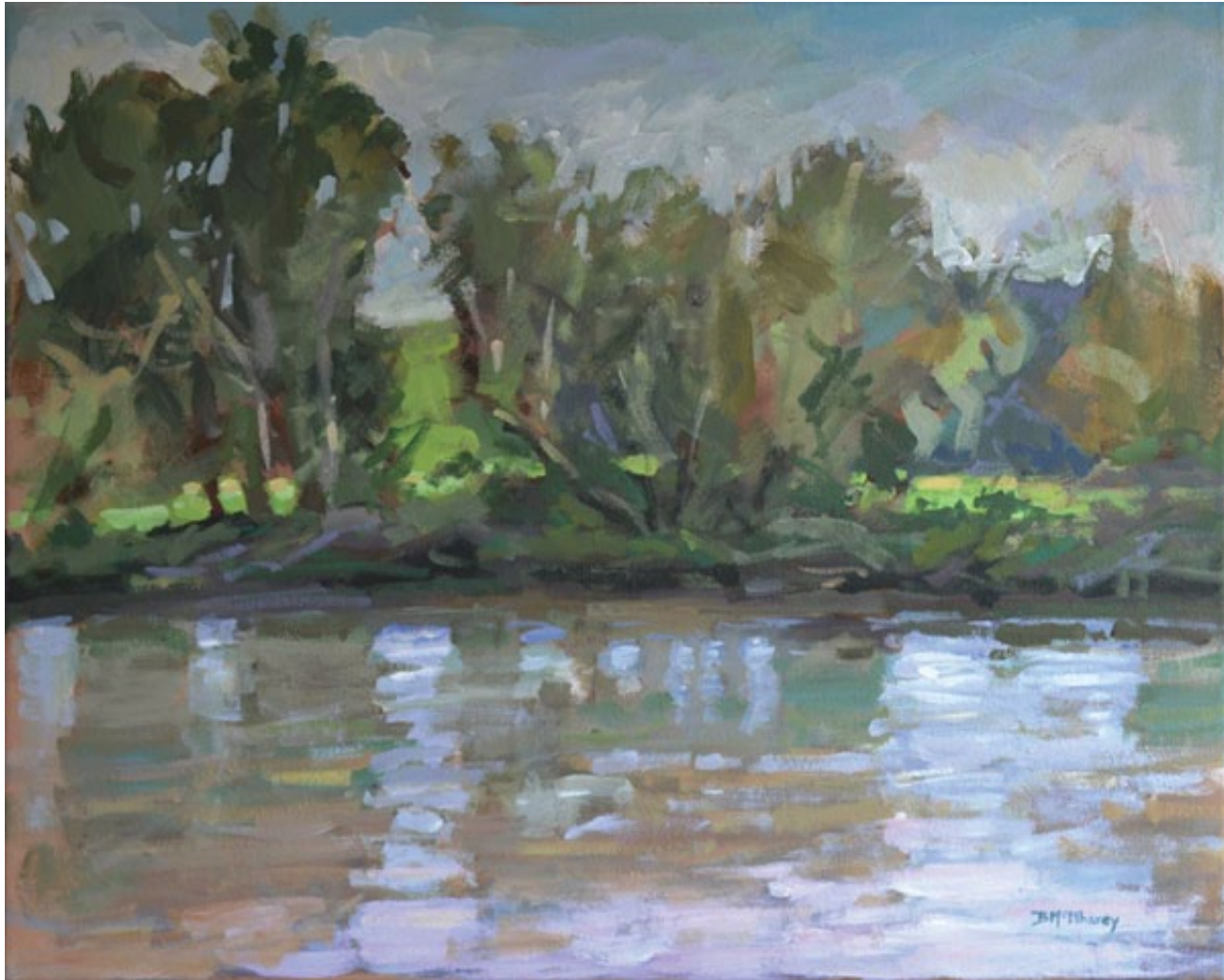
Across The River Acrylic on Canvas 16 x 20 inches

BRENNEN McELHANEY Fine Art | Landscapes | Portraits