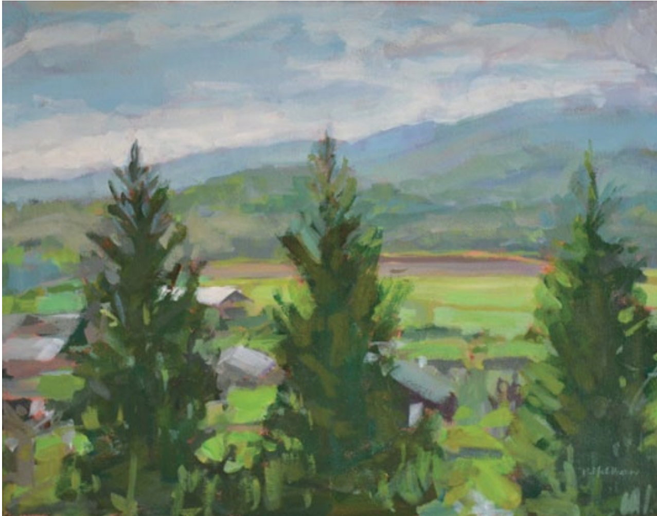
Warren Wilson Farms Acrylic on Canvas 11 x 14 inches

BRENNEN McELHANEY Fine Art | Landscapes | Portraits