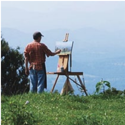
Painting on location at Bearwallow Mountain Gerton, NC