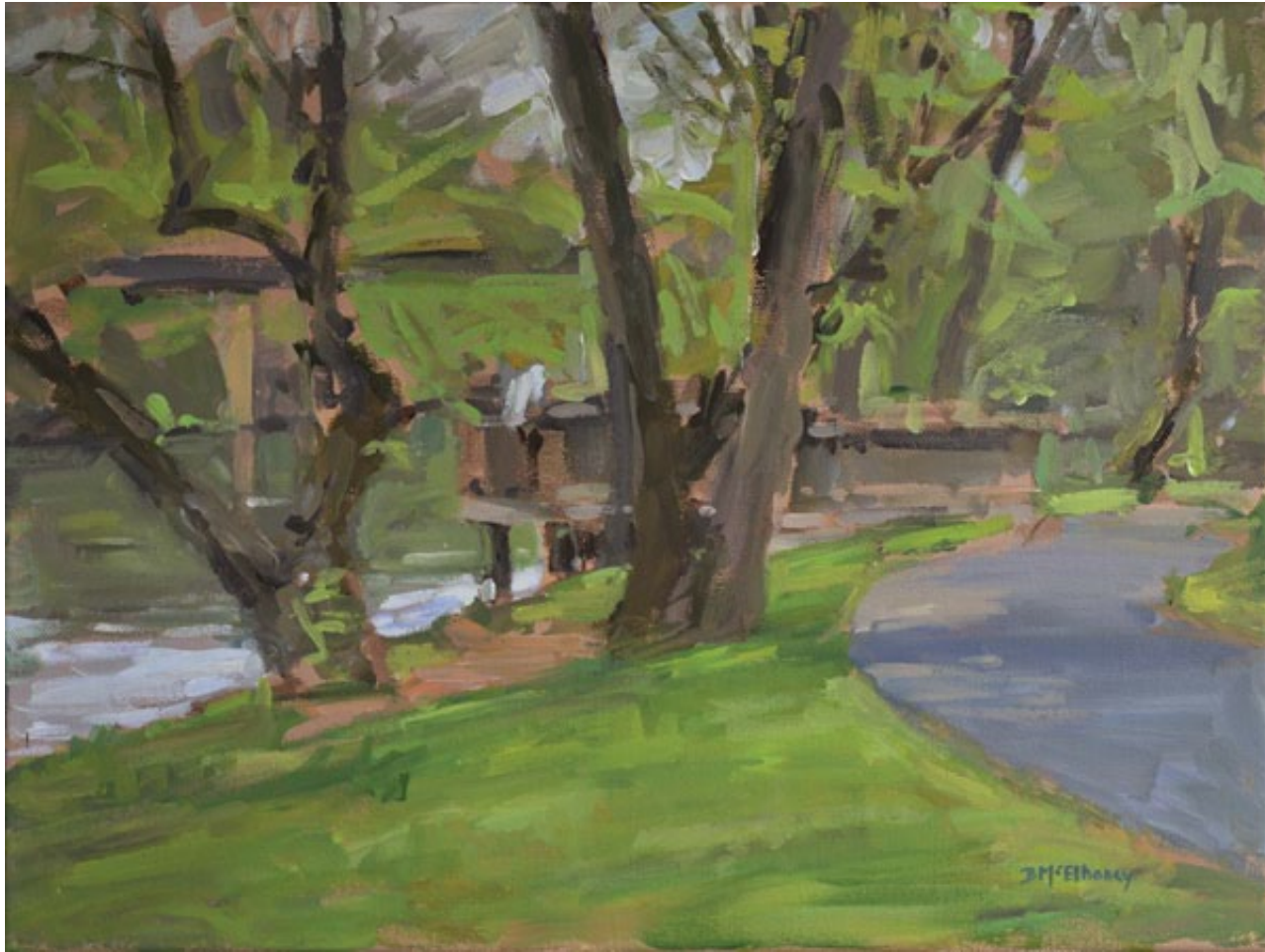
French Broad River Park Acrylic on Canvas 12 x 16 inches

BRENNEN McELHANEY Fine Art | Landscapes | Portraits