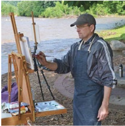
Painting on location at the Nolichucky River Nantahala Outdoor Center, Erwin, TN