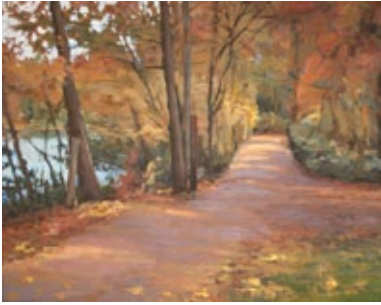
Brennen McElhane, Singing Creek Trail Acrylic on canvas, 19 x 24 in.