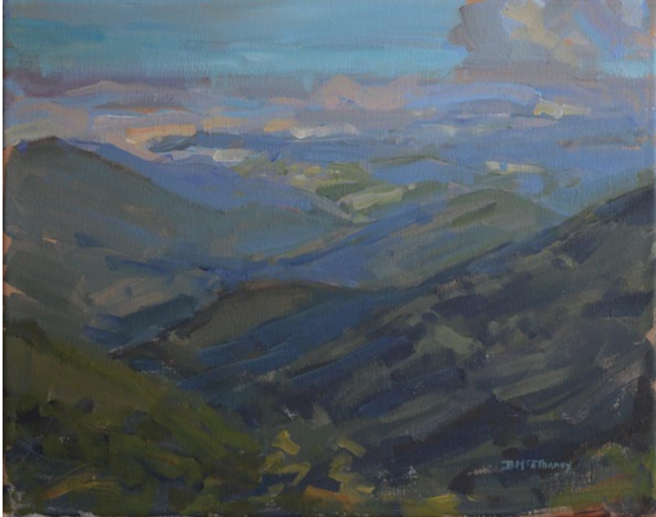
Craggy Overlook Acrylic on Canvas 11 x 14 inches

BRENNEN McELHANEY Fine Art | Landscapes | Portraits