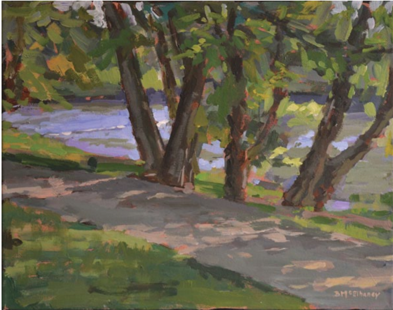
Path at French Broad River Park Acrylic on Canvas 11 x 14 inches

BRENNEN McELHANEY Fine Art | Landscapes | Portraits