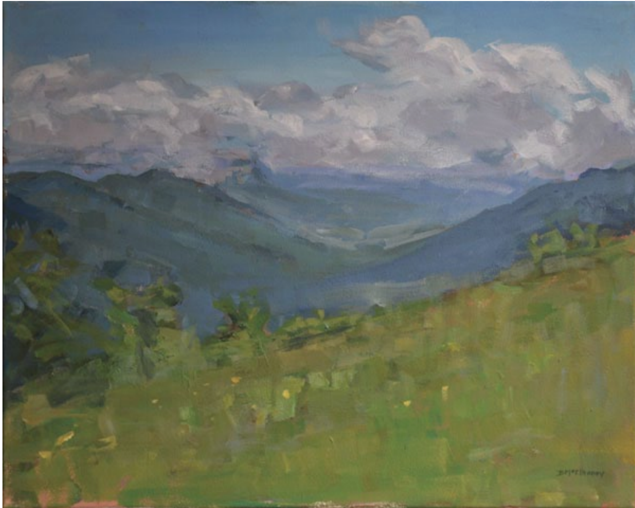
Parkway Overlook Acrylic on Canvas 16 x 20 inches

BRENNEN McELHANEY Fine Art | Landscapes | Portraits