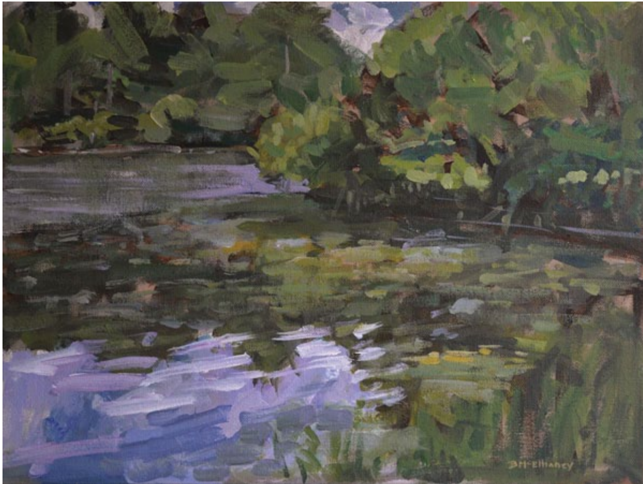
Highland Lake Acrylic on Canvas 12 x 16 inches

BRENNEN McELHANEY Fine Art | Landscapes | Portraits